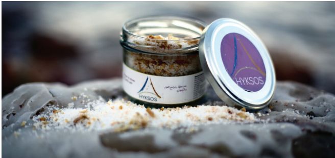
Hyksos Ginger and Garlic Salt

Dead Sea salt combining the Asian flavors of spicy candied ginger and garlic gives an exotic taste experience and serves as a cornerstone of Asian cuisine.