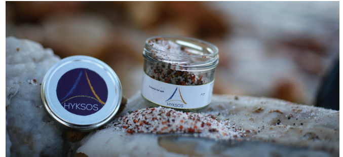
Hyksos Salt with hot chili pepper

Dead Sea salt combining the Asian flavors of spicy candied ginger and garlic gives an exotic taste experience and serves as a cornerstone of Asian cuisine.